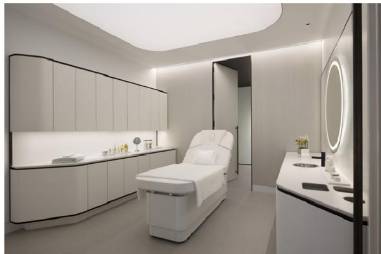
NYDG Integral Health and Wellness is located at 119 Fifth Avenue in New York.