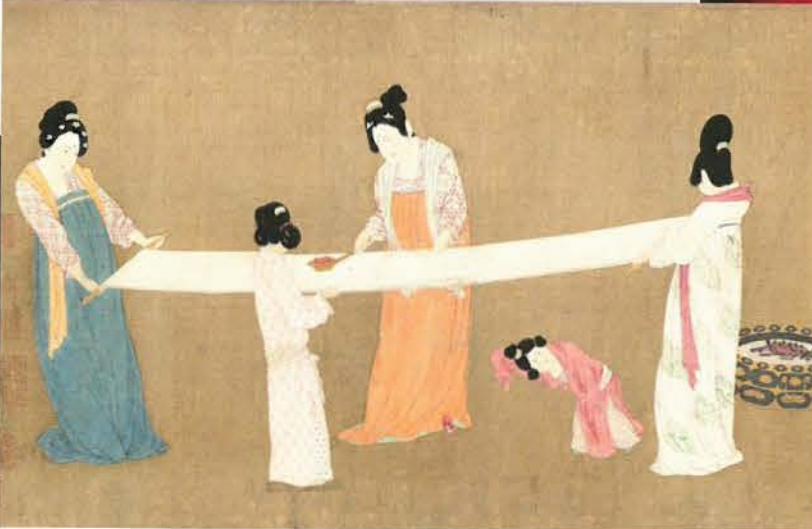
FEMINE PERSPECTIVE LEFT: LI AT THIS YEAR'S GALA. FROM TOP: HONG LEI'S EMBROIDERED SPRING DREAMS; ILLUSTRATION OF THE "GOLDEN-VASE PLUMS" POEMS, 2002; EMPEROR HUIZONG'S EARLY-12TH CENTURY COURT LADIES PREPARING NEWLY WOVEN SILK.