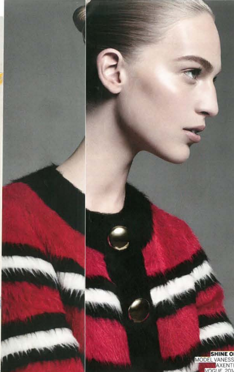
SHINE ON MODEL VANESSA AXENTE, VOGUE, 2014.