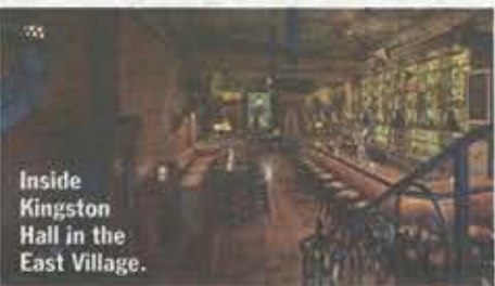
Inside Kingston Hall in the East Village.