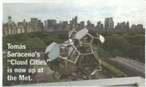
Tomás Saraceno's "Cloud Cities" is now up at the Met.