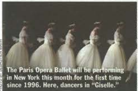
The Paris Opera Ballet will be performing in New York this month for the first time since 1996. Here, dancers in "Giselle."