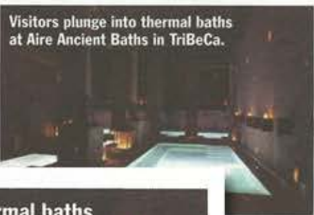
Visitors plunge into thermal baths at Aire Ancient Baths in TriBeCa.

In the Dark Performin time since will call Wednesda hot ticket "Mike Tys opens a July 31. in the Pa line out or at re the city, ets to s Woods." is set fo Botanica of Baud