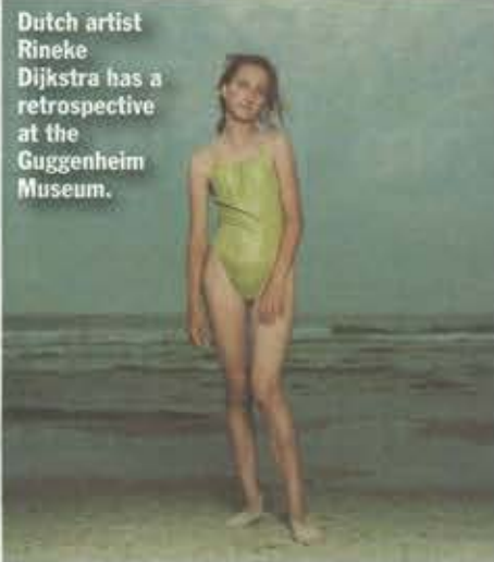
Dutch artist Rineke Dijkstra has a retrospective at the Guggenheim Museum.

SUMMERING IN the city doesn't have to mean spending hours in air-conditioned captivity. From the Hudson River to the New York Botanical Garden, there are a bundle of events and outings in and around Manhattan this month that will offer a break and a blast of fresh air from the trade-show circuit. Here, a sampling of cultural, recreational and energy-boosting indulgences.