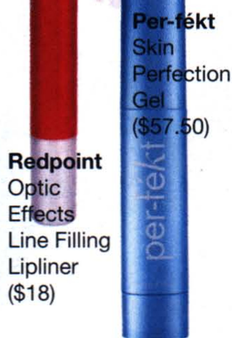
Redpoint Optic Effects Line Filling Lipliner ($18)