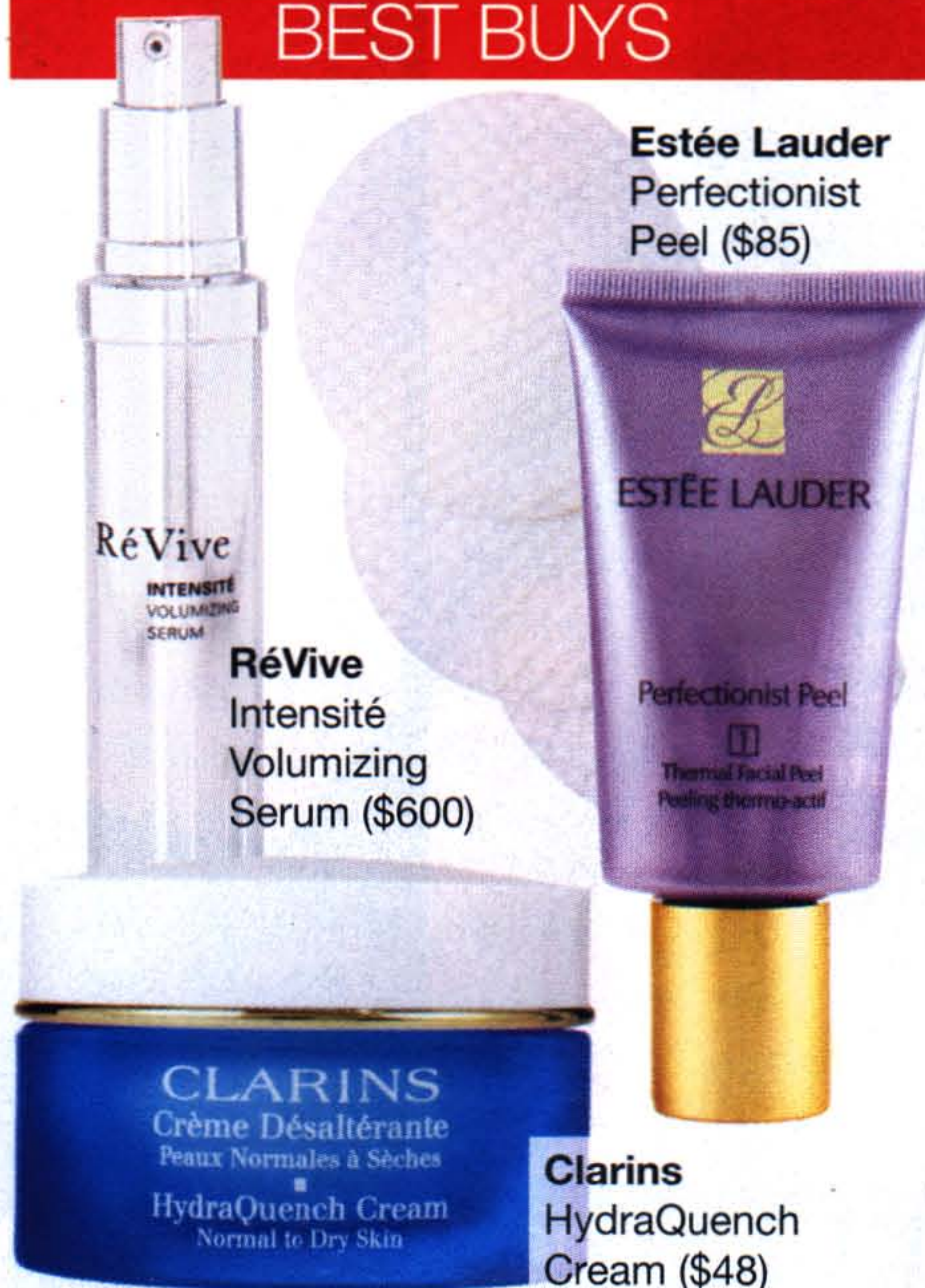
Estée Lauder Perfectionist Peel ($85)