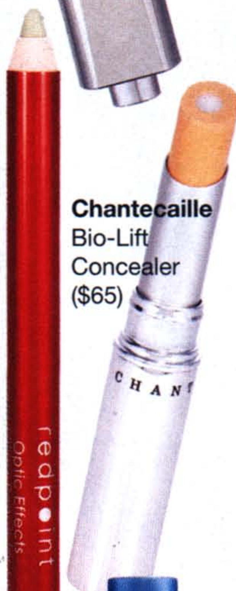
Chantecaille Bio-Lift Concealer ($65)