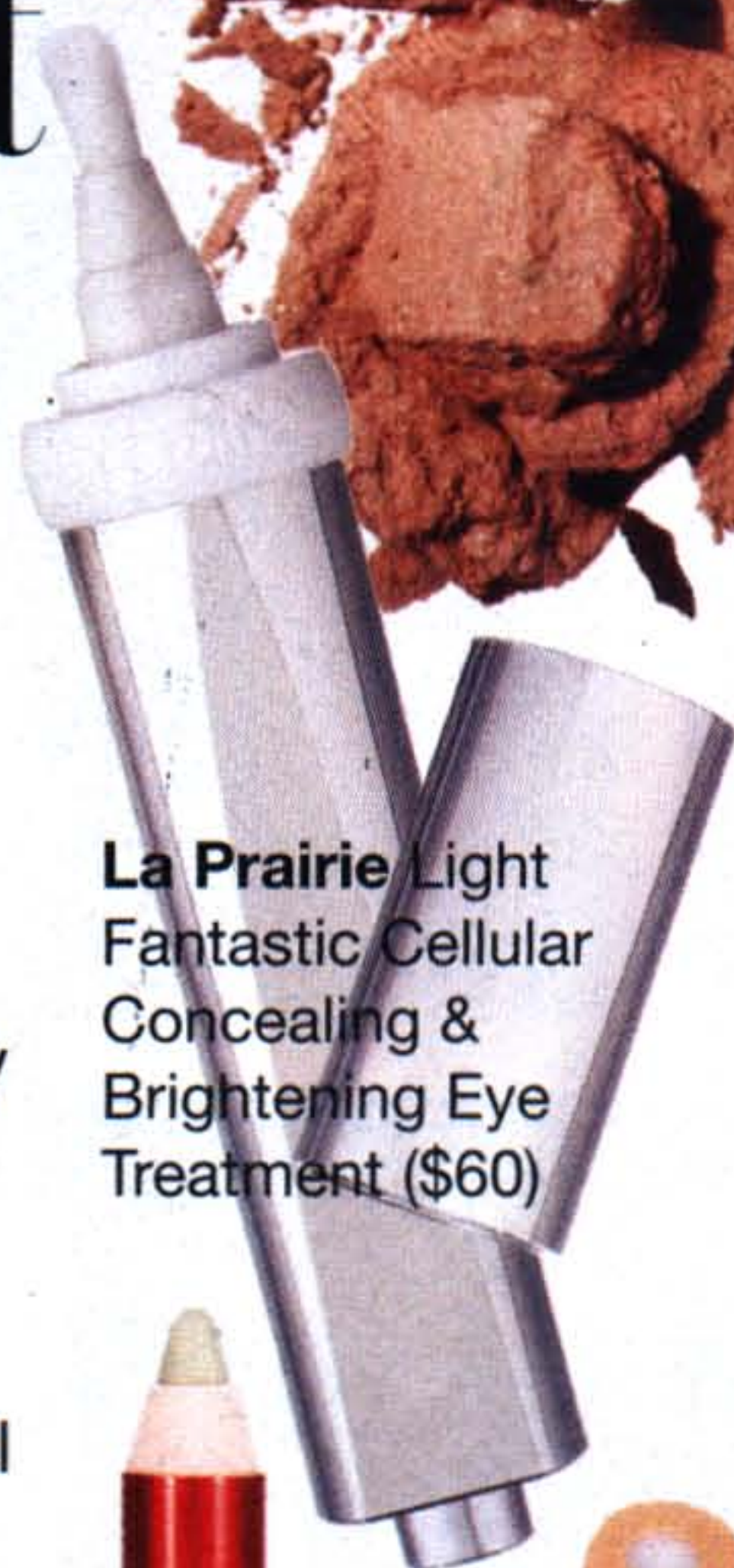
La Prairie Light Fantastic Cellular Concealing & Brightening Eye Treatment ($60)

Power base: Foundations with lifting and firming ingredients plus light diffusers can give the impression of complexion perfection. New York City makeup artist Carmindy is a fan of La Mer the Treatment Crème Foundation SPF 15 ($85). "It goes on like a dream and makes every complexion look immaculate, luminous, and better rested," she says. Napoleon Perdis Light Diffusing Makeup ($42) uses light-diffusing particles to help blur flaws while treating and protecting the skin with antioxidants. "Avoid applying foundation to the forehead," Perdis says. "It will settle into lines and wrinkles and instantly age you."