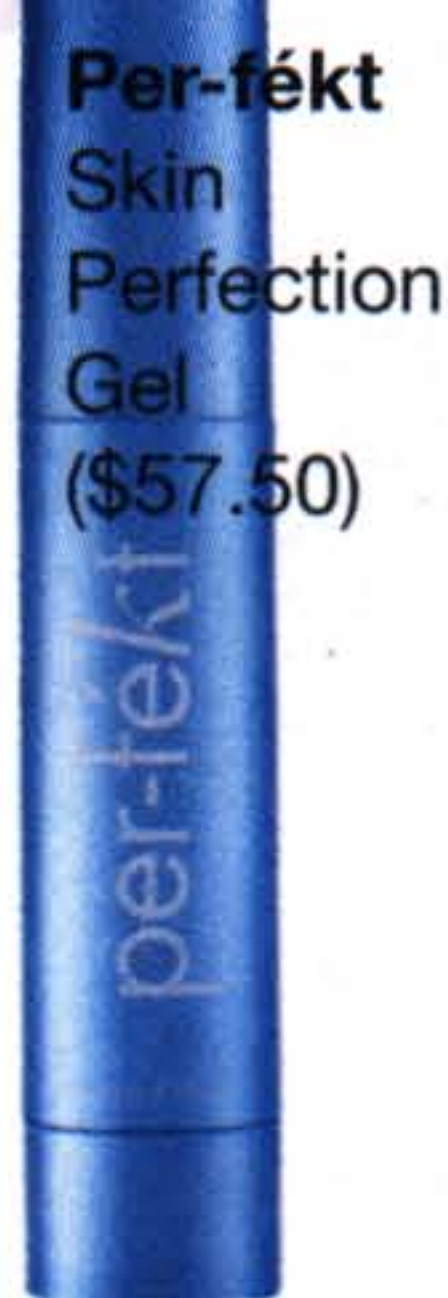
Per-fékt Skin Perfection Gel ($57.50)

pout, plus light diffusers to blur the appearance of indentations. Guerlain KissKiss Liplift ($27) incorporates microbeads to smooth lips and boost volume.